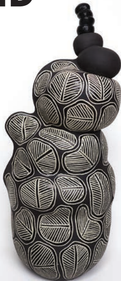
Sally Walk, A Little Off Centre , 2022 Midfire clay with black slip and clear glaze, 65 x 23 x 30 cm Major acquisitive prize winner, 2022 North Queensland Ceramic Awards . City of Townsville Art Collection.

The City of Townsville Art Collection Award of $10,000 continues to provide the opportunity for artists to become a part of one of the nation's most significant ceramic collections, as well as ensuring the continued growth of this important subsection of the City of Townsville Art Collection.